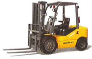
LG25DT OW:3800KG RP:40KW RC:2500KG LxH:3610*2030MM