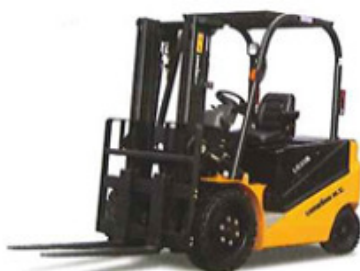
LG35B OW:5440KG RP:3500KG B:80V/500AH LxH:3648*2175MM