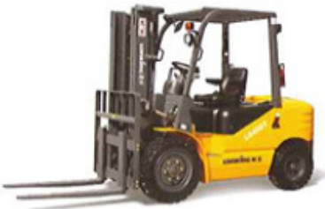
LG40DT OW:5000KG RP:45KW RC:4000KG LxH:3993*2343MM