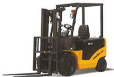
FB20 OW:3760KG RP:2000KG B:48V/600AH LxH:3430*2210MM