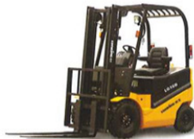
LG16BE OW:3100KG RC:1600KG B:48V/500AH LxH:2823*1995MM