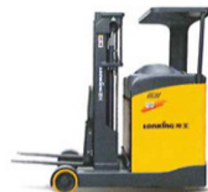
LG20DR OW:3415KG RP:2000KG B:48V/480AH LxH:2480*2601MM