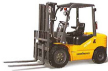
LG35DT OW:4700KG RP:42KW RC:3500KG LxH:3788*2100MM