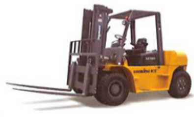
LG70DT OW:9550KG RP:81KW RC:7000KG LxH:4800*2625MM