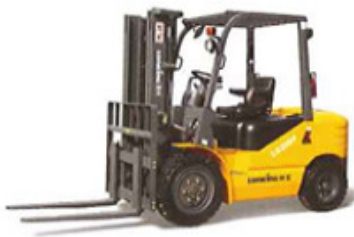
LG30DT OW:4350KG RP:40KW RC:3000KG LxH:3775*2100MM