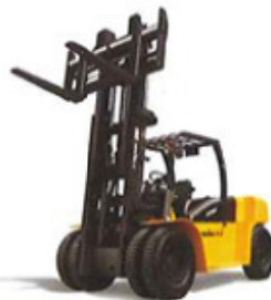
LG100DT OW:12800KG RP:92KW RC:10000KG LxH:5816*2845MM