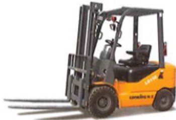
LG15D OW:2550KG RP:30KW RC:1500KG LxH:3170*1995MM