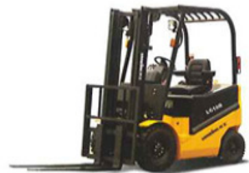
LG18B OW:3216KG RC:1800KG B:48V/500AH LxH:2823*1995MM