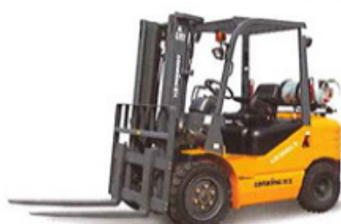
LG30GLT OW:4280KG RP:37KW RC:3000KG LxH:3775*2100MM