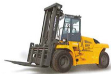
LG160DT OW:23000KG RP:140KW RC:16000KG LxH:7420*3445MM