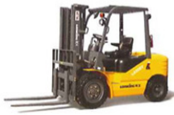
LG20DT OW:3450KG RP:40KW RC:2000KG LxH:3560*2030MM