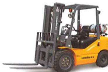
LG25GLT OW:3580KG RP:31KW RC:2500KG LxH:3560*2030MM