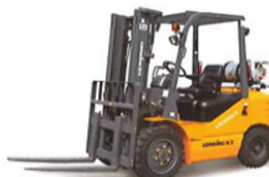
LG35GLT OW:4460KG RP:37KW RC:3500KG LxH:3850*2150MM