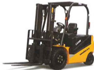
LG30B OW:4920KG RP:3000KG B:80V/500AH LxH:3608*2175MM