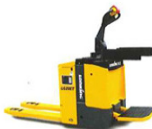
LG20ET OW:700KG RP:2000KG B:24V/240AH LxH:2283*1455MM