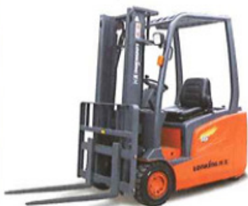
LG16B OW:3120KG RC:1600KG B:48V/480AH LxH:3018*2135MM