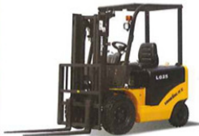
LG25 OW:3980KG RP:2500KG B:48V/600AH LxH:3430*2210MM