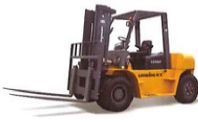
LG50DT OW:8600KG RP:81KW RC:5000KG LxH:4704*2500MM