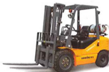
LG20GLT OW:3270KG RP:31KW RC:2000KG LxH:3560*2030MM