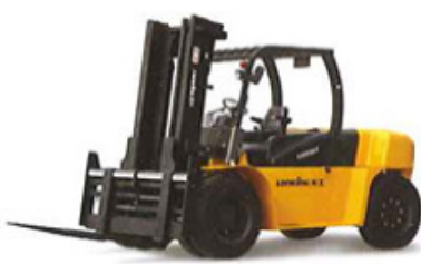
LG80DT OW:10700KG RP:92KW RC:8000KG LxH:5486*2845MM