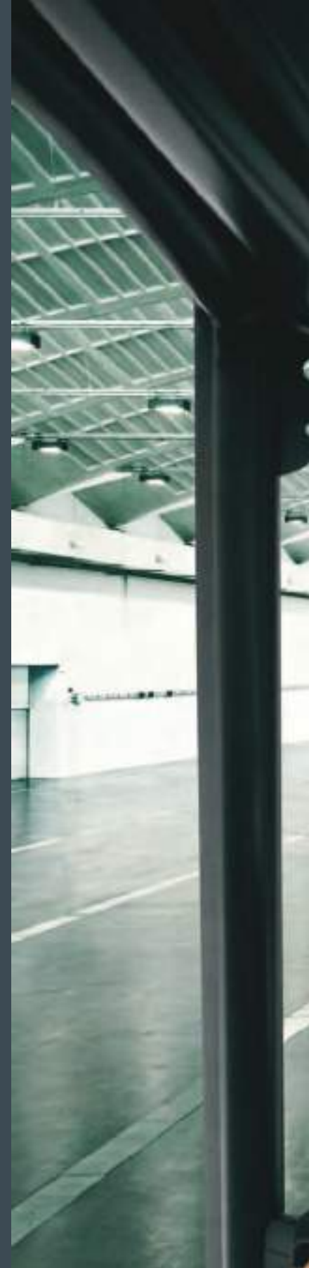
Narrow mast sections provide excellent visibility of load and workplace.