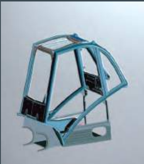
Linde ProtectorFrame. Unitized design yields reinforced overhead guard and frame structure.