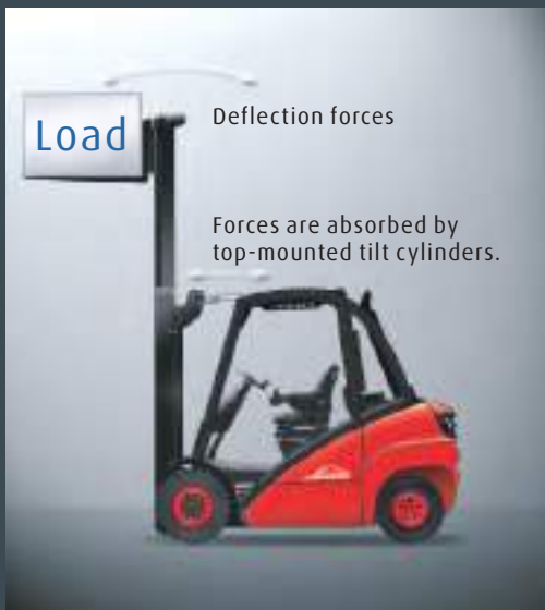
Clear-visibility mast. Top-mounted tilt cylinders allow use of narrow mast sections.

Even when stationary, a Linde forklift is ahead of the competition where safety is concerned. Should the operator forget to apply the parking brake the Linde hydrostatic transmission system automatically prevents the truck from rolling on a level surface.