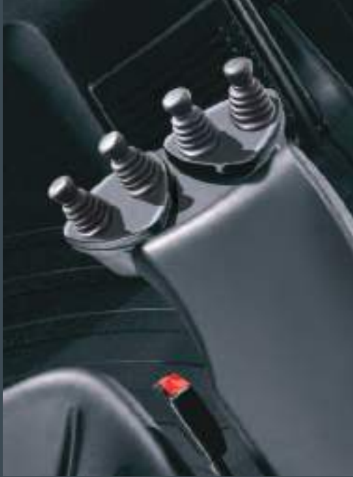
Minimum physical effort. Effortless control of all mast and operational hydraulic functions with the unique Linde Load Control joysticks.