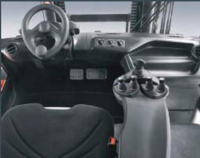
Versatile. Some operators prefer the single pedal travel control over the dual pedal system.