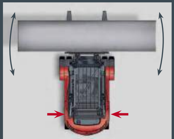
Sturdy overhead guard with Linde Torsion Support absorbs up to 30 % of torsional forces.