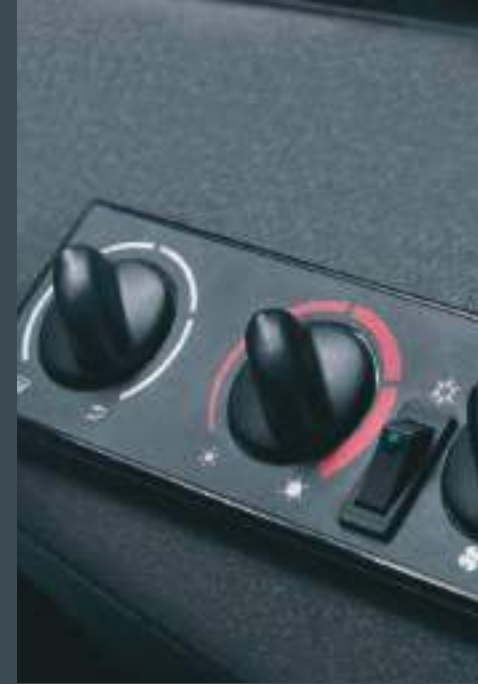
Motivation. Comfort for the operator throughout the shift with cab heater, optional air conditioning.