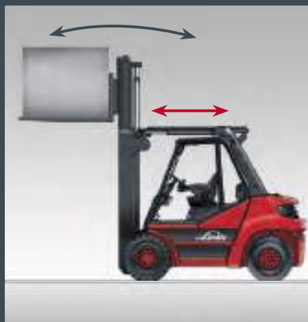
Top-mounted tilt cylinders minimize mast deflections. Heavy loads are always under control throughout the handling cycle.

Safety is maximized by Linde Torsion Support on the cab roof. By neutralizing up to 30 % of the torsional forces, stresses on the mast are minimized. As a result, these trucks are the true heavyweight specialists.