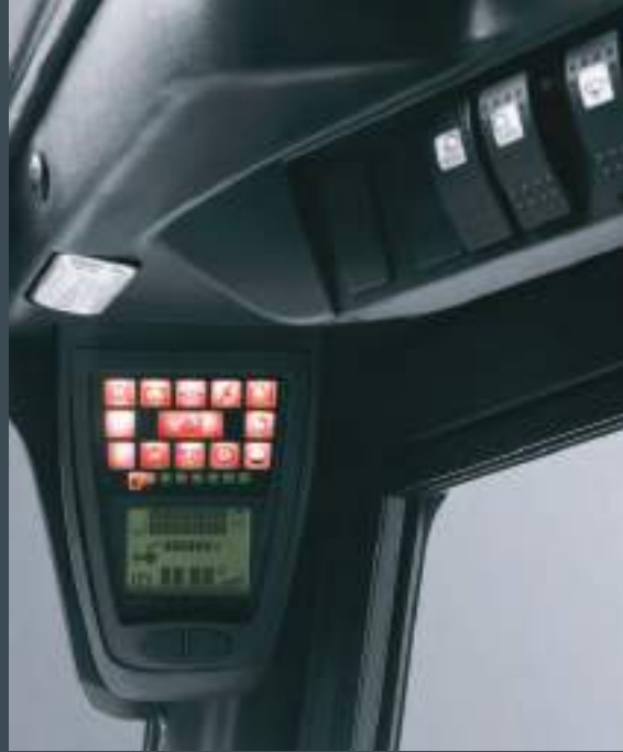
Fully informed. Essential information is presented on the glarefree multi-function instrument display at the press of a button.